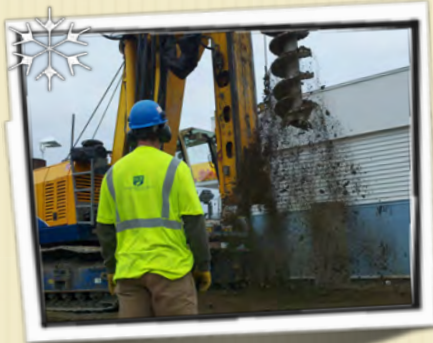
SCE installs caissons on CT project.