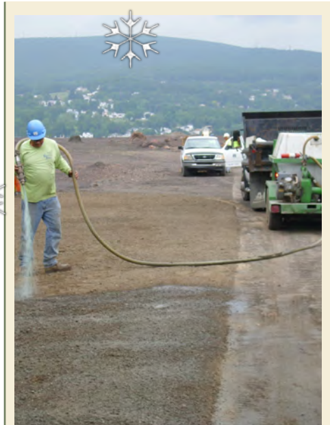
SCE crews self-perform hydro-seeding activities on a 9.5 ac. landfill capping project.

In 2011, SCE distributed over 1.5 Million Pounds of H 2 O 2 safely and efficiently to over 64 projects in 9 states. SCE's peroxide vehicles drove over 48,000 accident free miles.