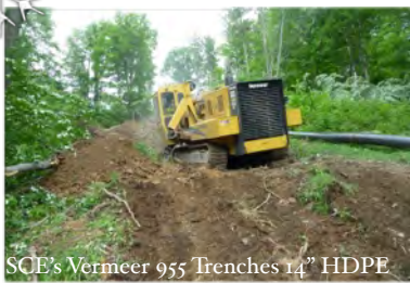
SCE's Vermeer 955 Trenches 14" HDPE

SCE's crews recently completed over 22,000 LF of water conveyance pipelines in Susquehanna and Bradford Counties, PA. These pipelines will carry fresh water to well pad sites for fracking of Marcellus Gas wells.