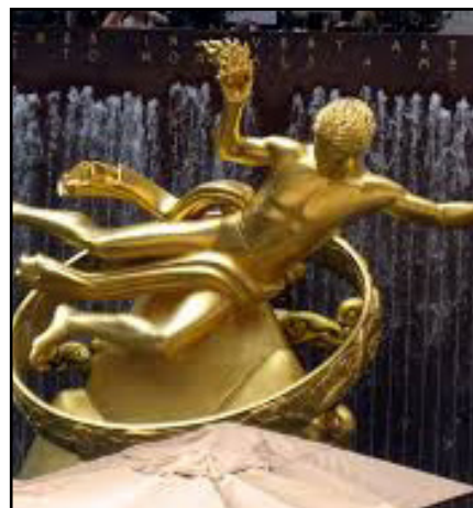
Offices of NBC Broadcasting at Rockefeller Center, NY, NY