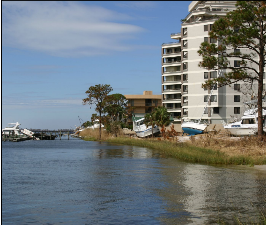
Boats line the water's edge as the storm surge subsides.