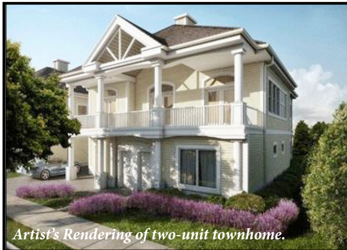
Artist's Rendering of two-unit townhome.

Progress continues at SCE's premiere major construction effort at City Island in New York City. The project, known by the name “On the Sound”, was featured in the New York Times as “the first large-scale residential development in about 15 years for City Island, a place that is reminiscent of a fishing village in New England and as such an anomaly within the borders of New York City.”